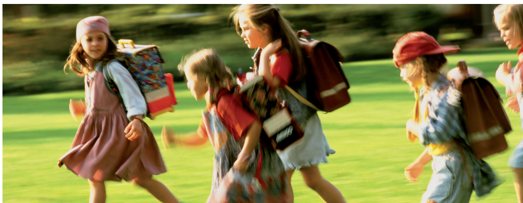
Designing tomorrows healthcare for the future generation